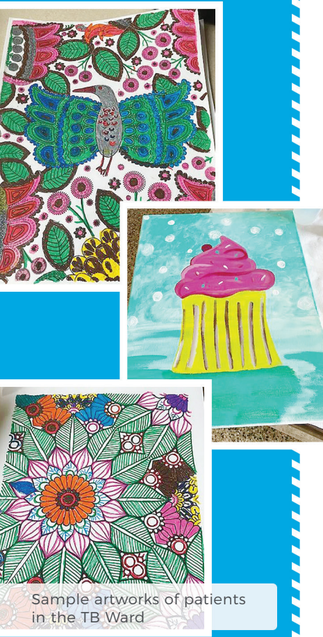
Sample artworks of patients in the TB Ward

I am always impressed with how our TB patients handle having to be in hospital for such a long time, but I know that they are able to in part because of the support from TB Vets. We asked patients who were transferred from other hospitals, where some of them had left treatment against medical advice, what they found most helpful at the TB unit at VGH. One patient said: "I'm a very social person. Here I can wander around, meet people and even go outside. At the other hospital, they wouldn't let me out of my room and I only saw staff for a few minutes a day. It felt like a prison." This contrasting experience speaks volumes to the impact TB Vets support has on the quality of life of our patients, and how it helps them complete their treatment. So on behalf of all of our staff and especially patients, thank you!