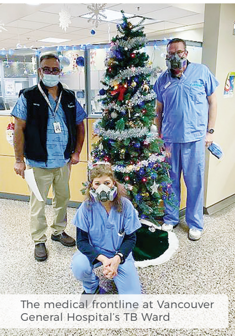
The medical frontline at Vancouver General Hospital's TB Ward